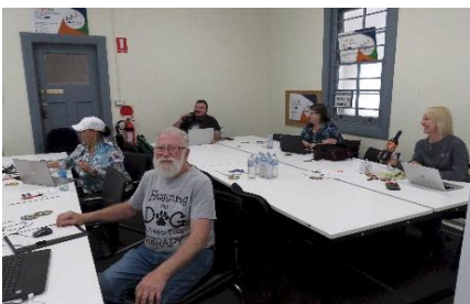
Participants at the Canva & Instagram workshop

Members enjoyed participating in Andsley's Canva & Instagram workshop and learnt the intricacies of a valuable software package.