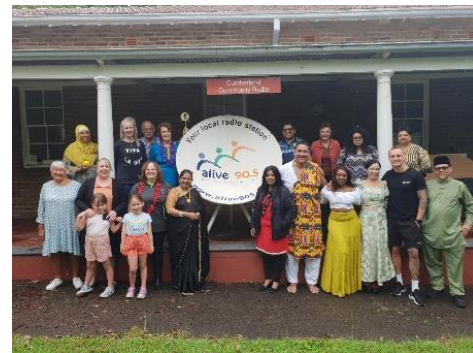
Harmony Day participants