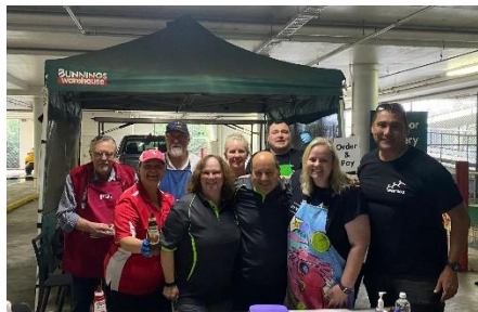
Successful Bunnings April sausage sizzle

Sunday to make the sausage sizzle at Castle Hill enjoyable. This one was our biggest success to date, with income at $1 396; expenses $645 leaving a net profit of $751. The other benefit to the station was receiving lots of expressions of interest for membership/volunteers/presenter & also interviews. Well done team. Bunnings Northmead on May 1 st was also a fun event.